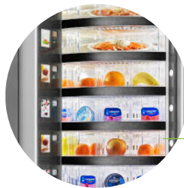
Flexible snack, food and drinks offer