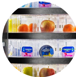
Variable temperature options