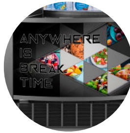
A simple design for a true automatic canteen