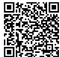
Energy Label Available with this QR code