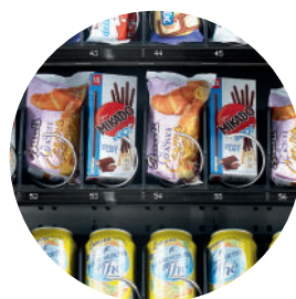
High visibility cell