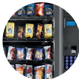
An elegant and uncluttered design