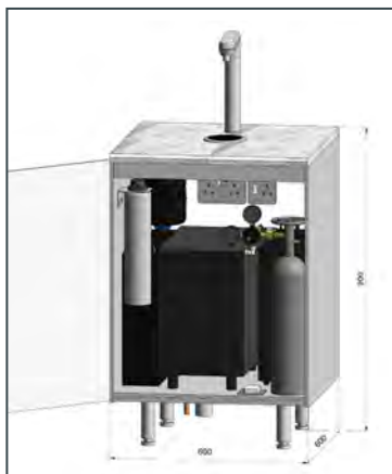
Aqua illi - BCS Full Installation