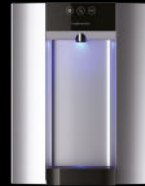
Silver - Countertop

Contains 3M carbon filter and parts required for easy installation.