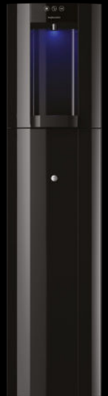
Black - Floorstanding