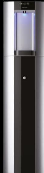
Silver - Floorstanding