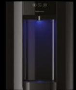
Black - Countertop