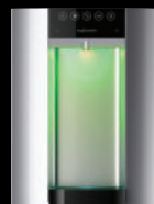
Silver - Countertop