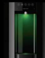
Black - Countertop