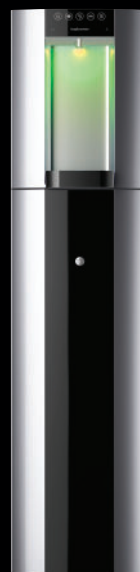
Silver - Floorstanding